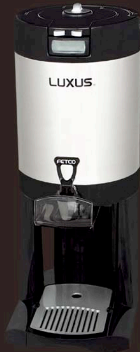
L3D-15 Capacity of 1.5 Gallon