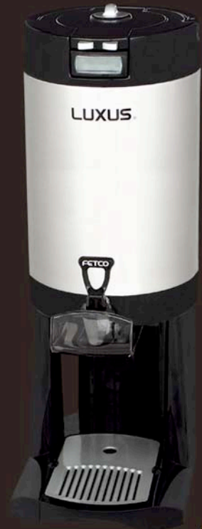
L3D-20 Capacity of 2.0 Gallon