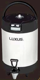
L3S-10 Capacity of 1.0 Gallon

The LUXUS® Thermal Dispensers have been depended upon to serve various functions, this versatile system can be put together modularly to fit all dispensing point needs.