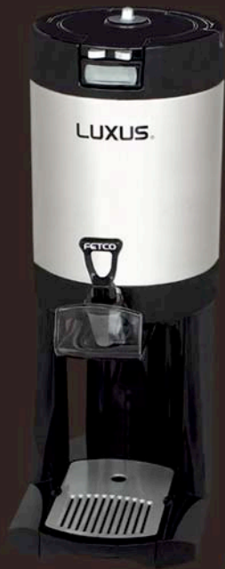
L3D-10 Capacity of 1.0 Gallon

LUXUS® Thermal Dispensers come with 3 different capacities: 1.0, 1.5 and 2.0 Gallons.