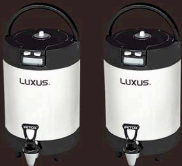
2xL3S-10 Total Capacity of 2.0 Gallon