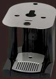
S3S-10-1 Single Stand for 1.0 Gallon LUXUS