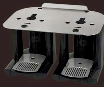
S3S-10-2 Double Stand for 2x1.0 Gallon LUXUS